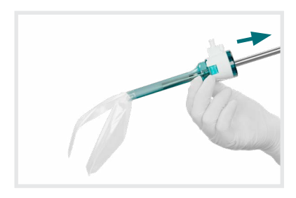
Remove the endoscope for complete balloon deflation.

After completing dissection, untwist the Luer lock connector counterclockwise, and disconnect the inflation bulb.